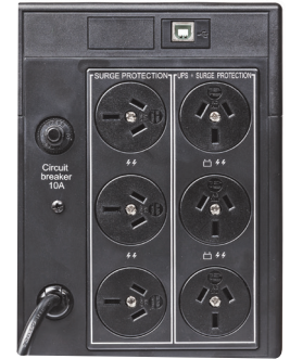
PSD1200 | PSD1600 | PSD2000