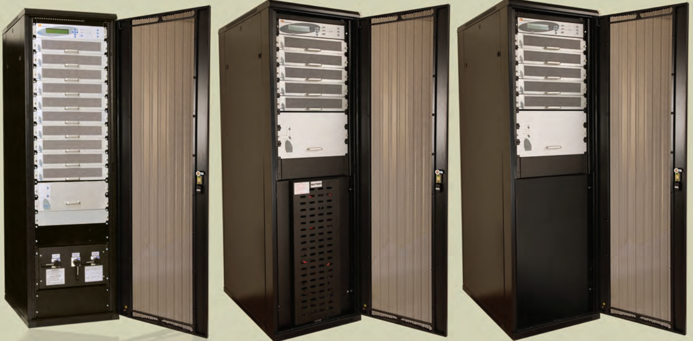
RM 100KVA : Power+ FS 10-100KVA; MMBS in Rack

Built for high-density aesthetics as well as usability, Power+ RM is available in uniform and modern cabinets that integrate perfectly with existing data center design. Alternately, Power+ RM components may be easily housed in existing racks.